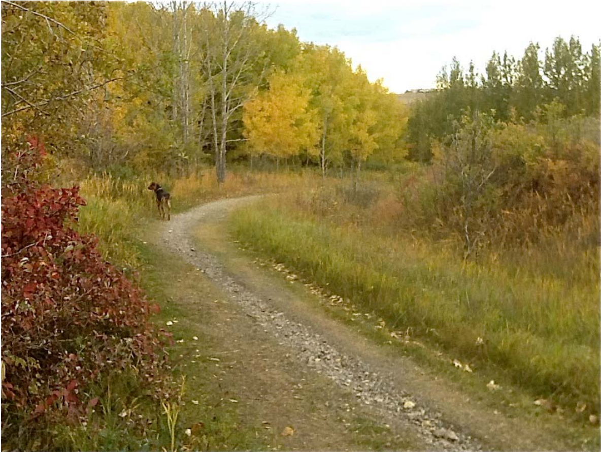
Fall colours on Nose Hill

Friends of Nose Hill Society Membership Year: 2014 $10.00