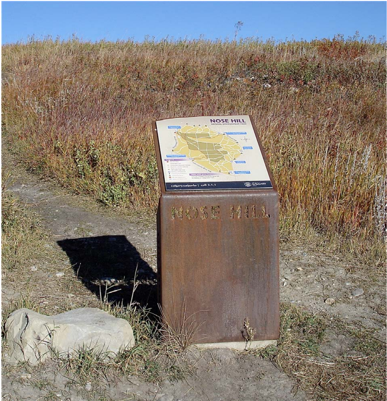
One of the permanent interpretive signs

There are new trail markers in the park, in addition to the Interpretive signs.