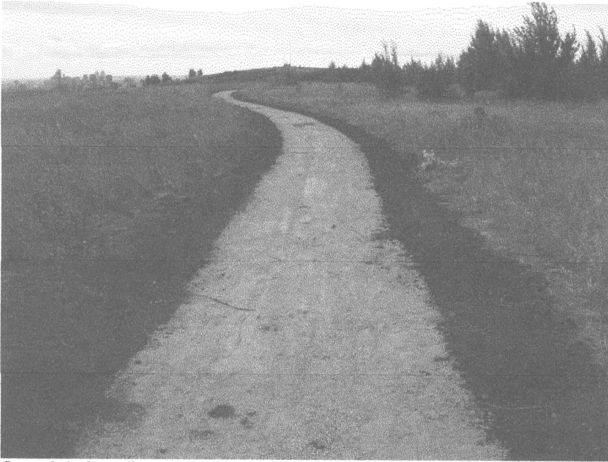
Completed section of the Upper Plateau Trail – east side of the gravel pit, overlooking downtown Calgary.