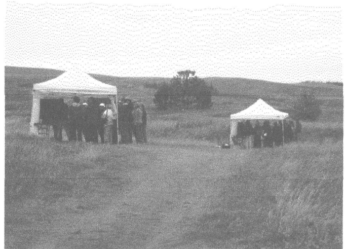
Participants traveled to four presentation stations to learn more about the park's natural and human history.