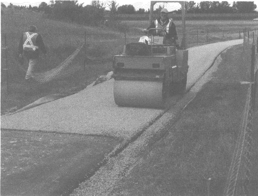
Crews applying the chip-seal top-coat to the asphalt pathway near the Edgemont park entrance.

For more information on this project, please visit the website at www.calgary.ca/parks