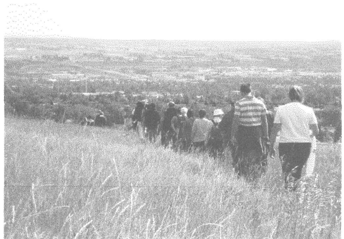
Over 60 participants took part in an interpretive hike along the east side of the park.

For more information on this project, please visit the website at www.calgary.ca/parks